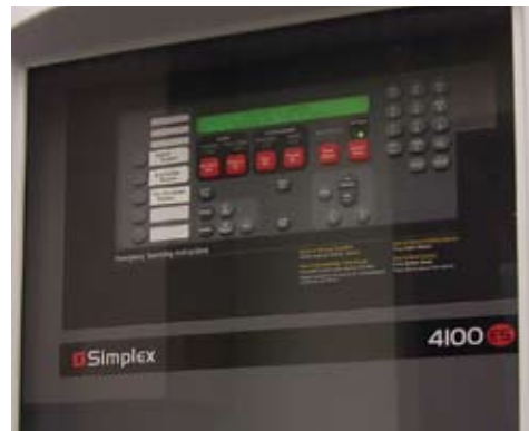
Control panel for Simplex 4100ES

The surgery center now has what we consider the best smoke detection and fire alarm